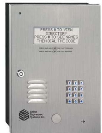
CAT 4 HF