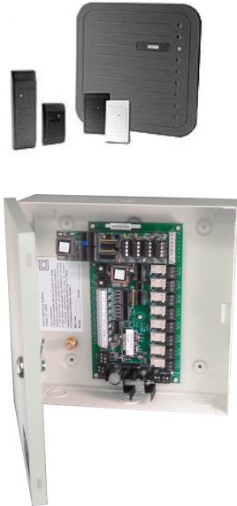
CATDR4 3 MAXIMUM PER CAT SYSTEM

Contact us for Card Reader options for your CAT Series Access Control System