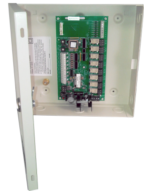
CATRLY8 32 MAXIMUM PER CAT SYSTEM