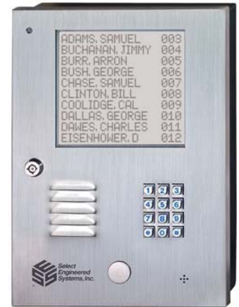
CAT 10 HF