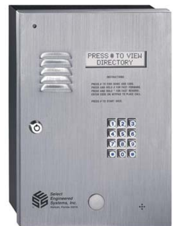
CAT 2 HF