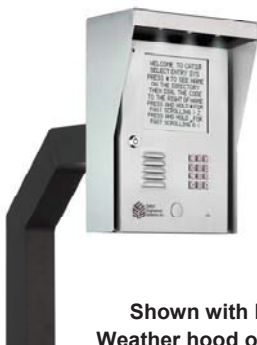
Shown with Lighted Weather hood on Pedestal