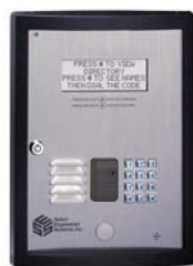
Shown with Black Designer Door Frame and HID Reader